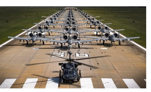
23rd Wing Elephant Walk

appreciative of the support and training they provided to me. Honestly, I intended to only serve four years and then separate, but between my first and second duty stations and the people around me, I made the choice to stick with the Air Force (AF) and see how far the journey would take me – and what an epic experience the FM life has been. There have been high and low points, but find me a job that doesn't have those, and we can discuss another time.